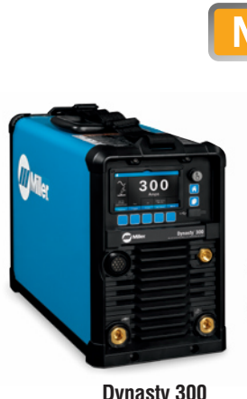
Dynasty 300 Machine only