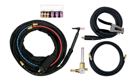
300990 kit shown.